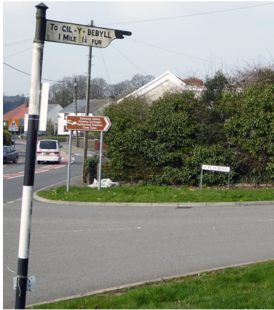
The unusual finger post at Rhos using miles and furlongs