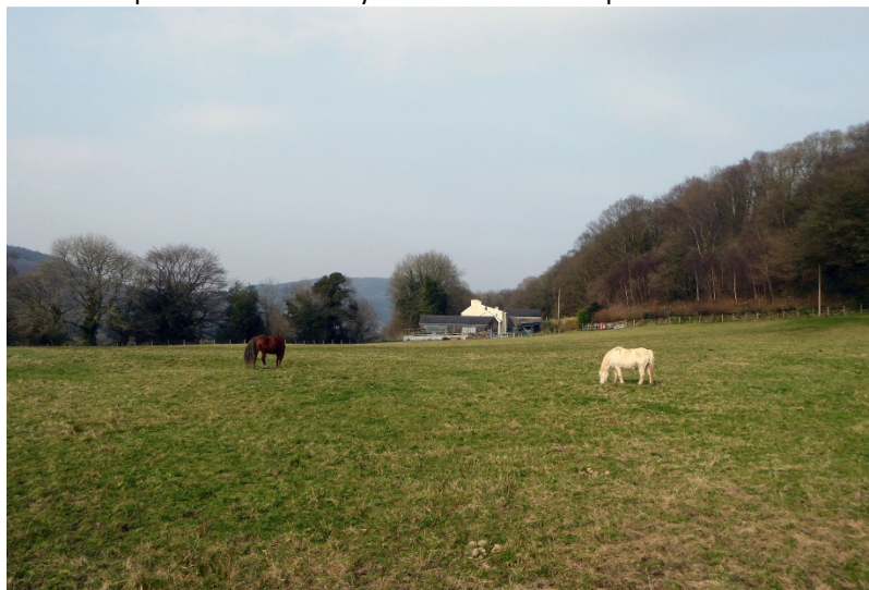
The path opens out to become a track above the river at Alltwen