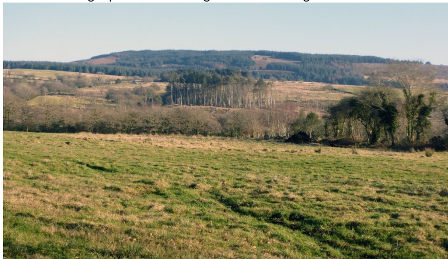
Looking towards Mynydd March Hywel from the Rhos-Cilybebyll road