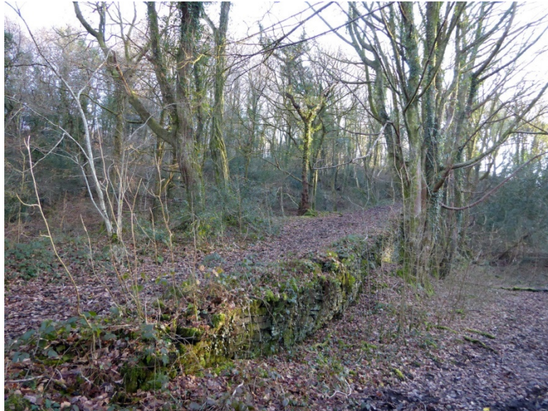
The lower part of the tramway before its final steep descent to the river