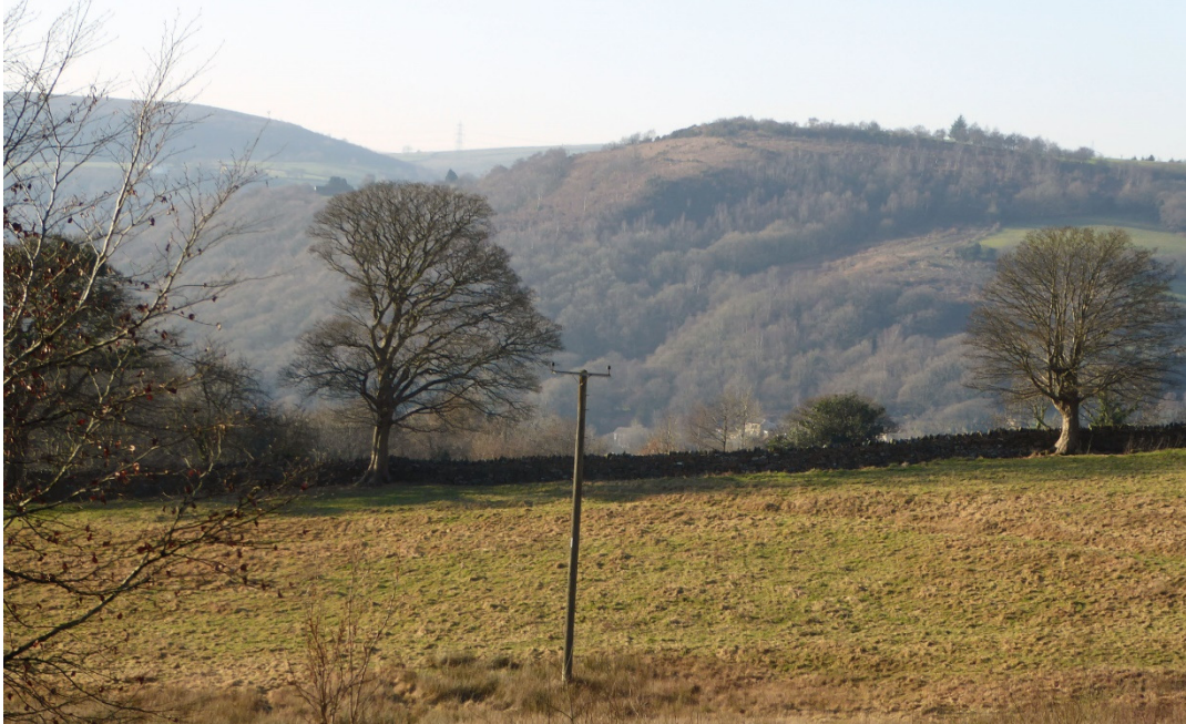
Looking towards Pontardawe from Cilybebyll village