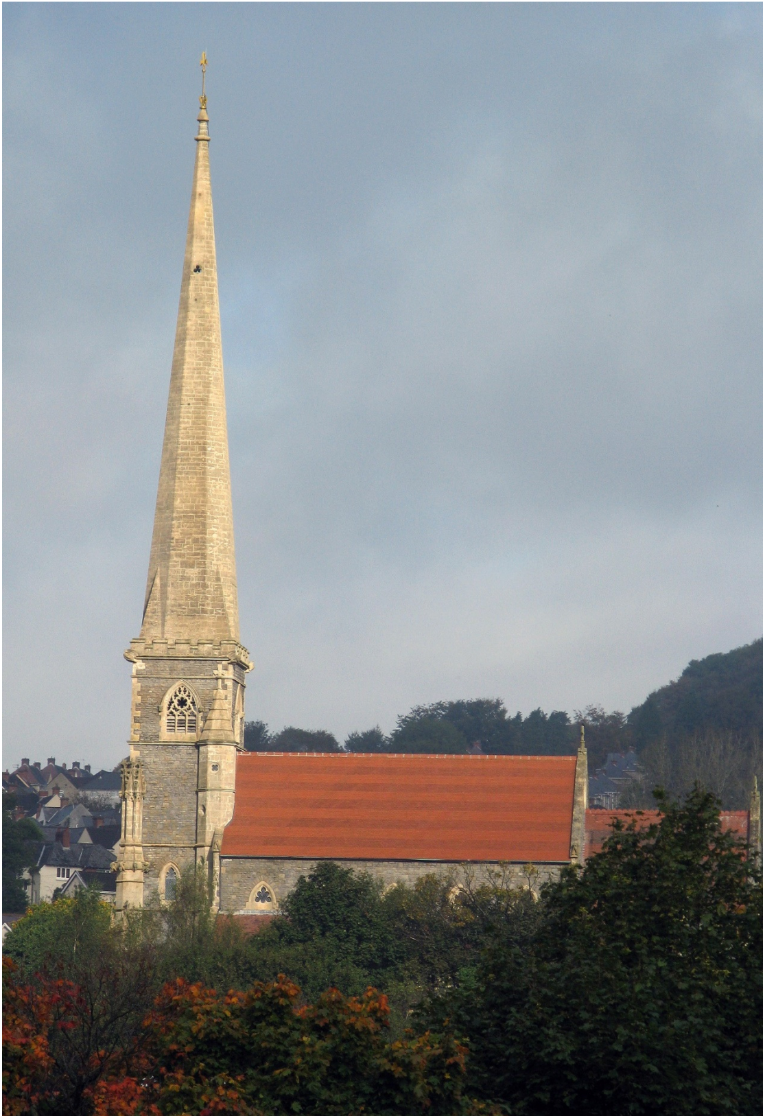
Despite its impressive stature towering over Pontardawe, St Catherine's Church doesn't come into view until just before the end of the walk