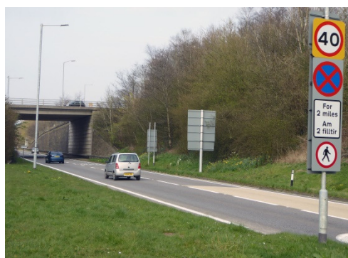
and (site of) now (2017)