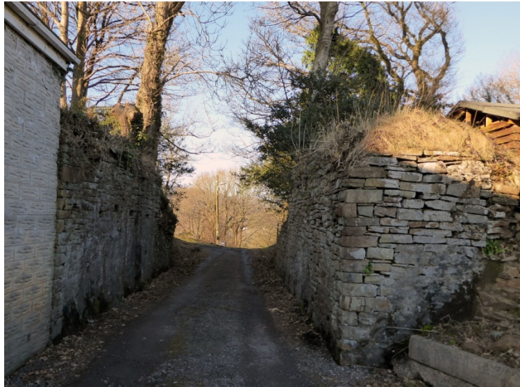
Start of the former tramway incline at Tramway Road, Cilybebyll