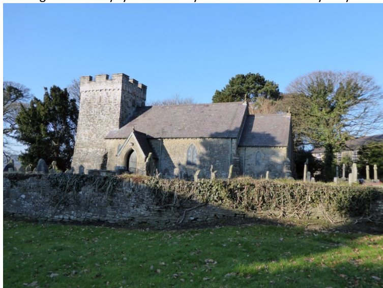
The attractive medieval church of St John the Evangelist at Cilybebyll