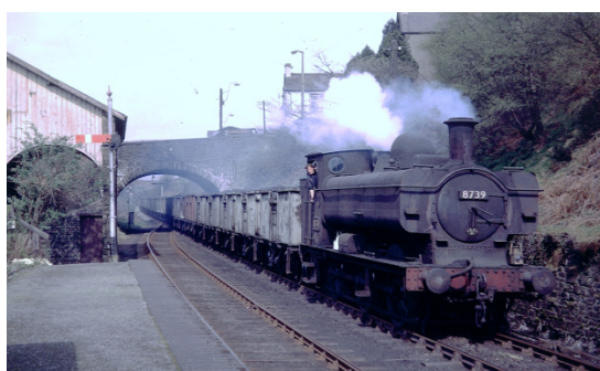
Pontardawe Station then (1964)

GR refers to Ordnance Survey grid reference