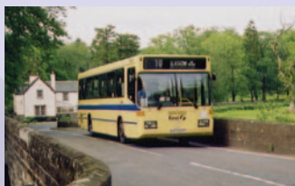
Glasgow bound early First Bus crossing Field Bridge