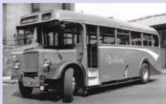
Balfron bus at Dundas Street bus station