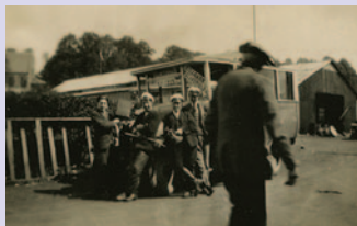
Rankin Brothers bus at Balfron's "Granny's Park" garage

Serving the local community for nearly 100 years