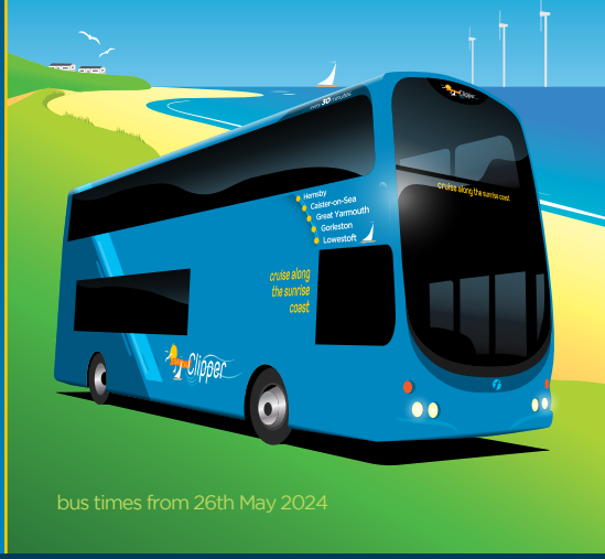
bus times from 26th May 2024