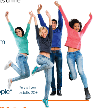
*max two adults 20+

unlimited travel, all day for up to 5 people*